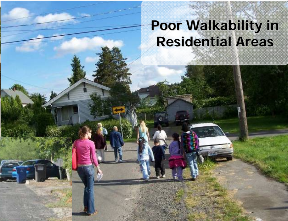
Poor Walkability in Residential Areas