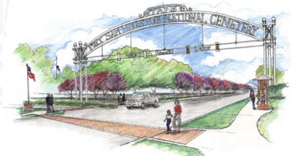
Conceptual streetscape of TAPS Memorial Blvd by Dixie Watkins III & Associates