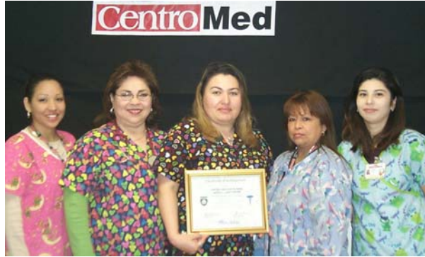
Centro Med South Park Medical Care Center- Zarzamora