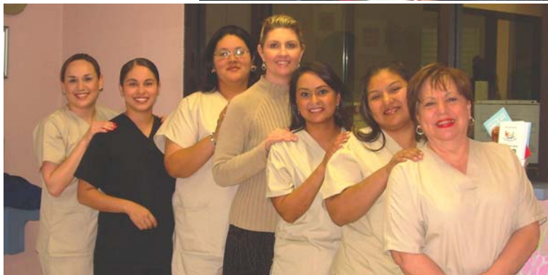
Kellum Pediatric Clinic-Marbach