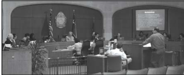
City Council recently made several procedural changes to increase the efficiency of its weekly meetings.

ordinate the 6:00 p.m. start time of Citizens to Be Heard. Additionally, all Council meetings this July will be rescheduled to allow Council and staff to work on issues associated with the FY 2007 Proposed Budget. Council meetings will resume the first week of August.