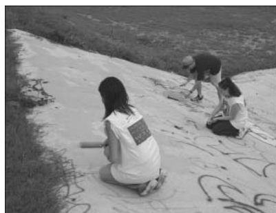
Volunteers at the last Graffiti Wipeout event.

During the last Graffiti Wipeout Day, more than 1,100 volunteers picked up brushes and rollers and painted over 100,000 square feet of graffiti eyesores on drainage channels, bridges and fences.