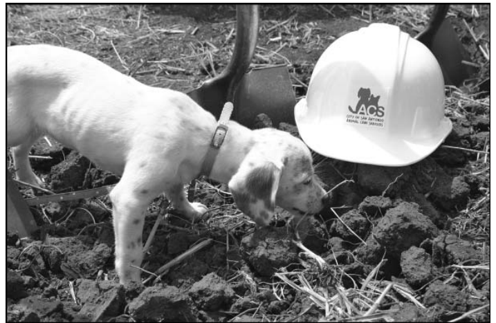
Ground has been broken on a new animal care facility to open in Fall 2007.

Recent policy changes at the current ACS facility include a new post-adoption veterinary care program and improvements to current infection control and sanitation procedures. Under the new post-adoption initiative, adopters are encouraged to bring their new pet back to ACS for a health evaluation if it shows signs of illness within the first two weeks of ownership. The goal is to treat minor illnesses at no cost to the new owner. This change is part of the adoption contract which also requires new owners to take their pet to a vet for a total physical. Initiatives such as increased daily medical health checks and additional oversight of sanitizing efforts inside the facility and with the trucks and equipment also have been implemented with the goal of decreasing the impact of infections. All of the ACS modifications are taking place in a facility that recently received a new air condition-