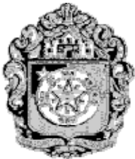
City of San Antonio