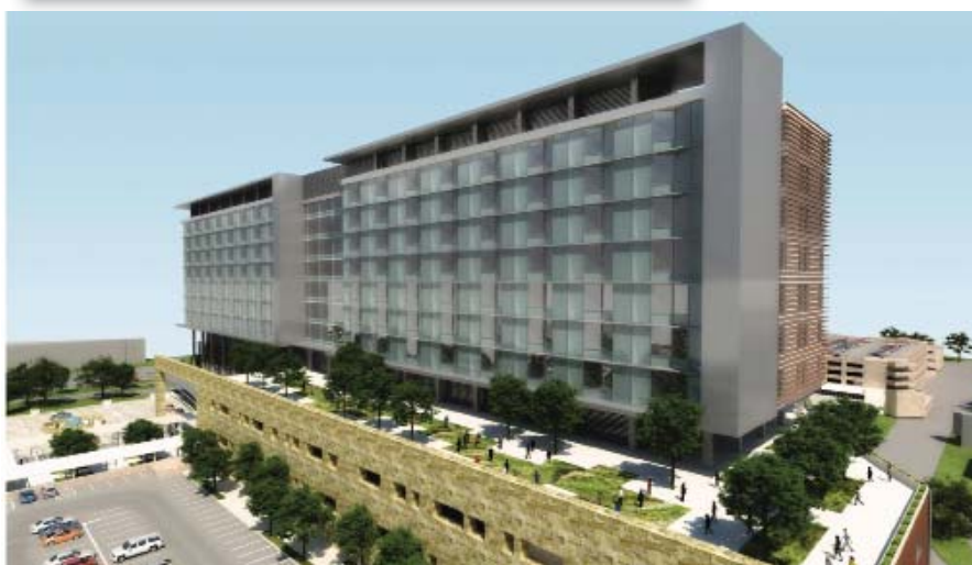
Artist rendition of the front of the tower proposed by Perkins + Will . Merton Minter is the street on the right.