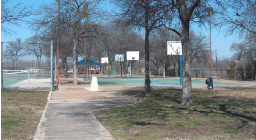
Area Park with Amenities