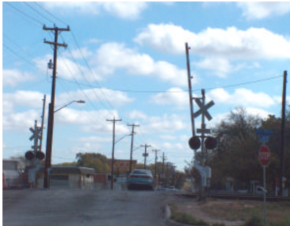
RR Tracks in Planning Area

The Infrastructure and Facilities chapter focuses on public amenities and necessities that are expensive to build and maintain. Issues addressed include: Storm water, Parks, Libraries, Streets, Sidewalks, Bicycles, Traffic Safety, Alleys, Bus/Transit, Railroads