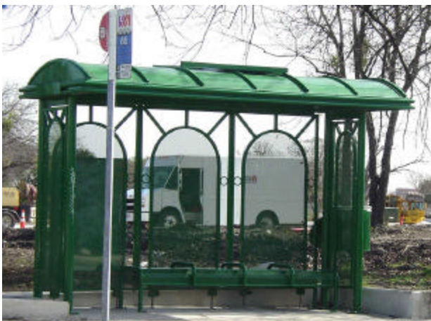
Area Bus Shelter