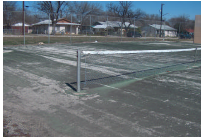
Tennis Courts in Need of Repair in Planning Area