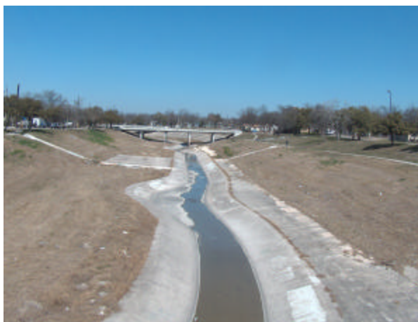
Area Creekway - potential amenity given enhancements