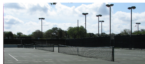
Fairchild swimming pool (top) and tennis courts (bottom).