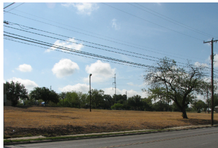
Open space at Lockwood Park.

Objective 1.3: Add more landscaping to existing parks