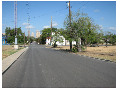
Burnet Street between Lockwood and Dignowity Parks.