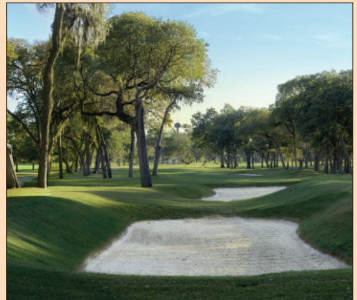
This Brackenridge Park Golf Course was designed in 1915 and is the oldest 18-hole public course in the state.

DISCLAIMER The City of San Antonio does not guarantee the accuracy, adequacy, completeness, or usefulness of any information. Individuals assume all risk and responsibility. Please note that many of these routes mix with urban vehicular traffic.