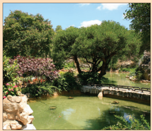
The Japanese Tea Gardens feature beautiful floral displays, a waterfall and a safe habitat for new Koi and aquatic plants.