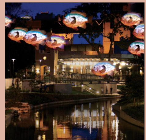
The new River Walk Museum Reach features native landscaping and dazzling public art.

DISCLAIMER The City of San Antonio does not guarantee the accuracy, adequacy, completeness, or usefulness of any information. Individuals assume all risk and responsibility.