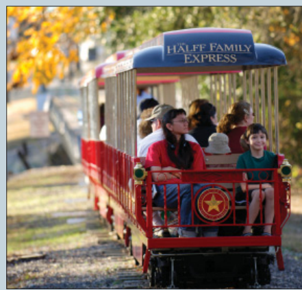
The San Antonio Zoo Eagle offers a nostalgic ride through Brackenridge Park.