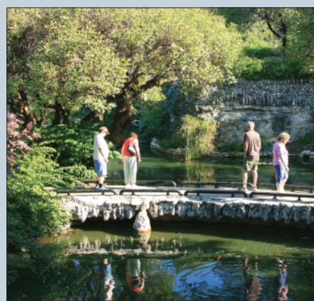
Brackenridge Park encompasses the Japanese Tea Gardens (above) and the San Antonio Zoo.

DISCLAIMER The City of San Antonio does not guarantee the accuracy, adequacy, completeness, or usefulness of any information. Individuals assume all risk and responsibility.