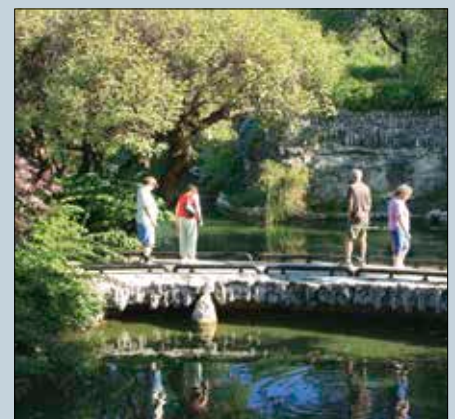
Brackenridge Park encompasses the Japanese Tea Gardens (above) and the San Antonio Zoo.

DISCLAIMER The City of San Antonio does not guarantee the accuracy, adequacy, completeness, or usefulness of any information. Individuals assume all risk and responsibility.