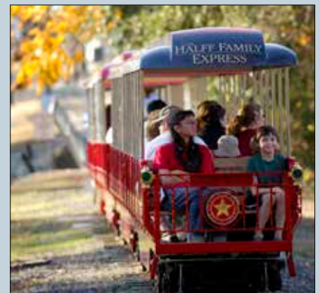
The San Antonio Zoo Eagle offers a nostalgic ride through Brackenridge Park.