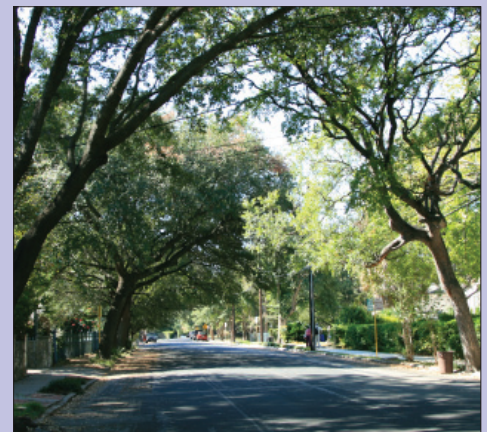
Enjoy a leisurely roll through the artistic King William Historic District.