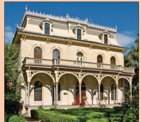
The Downtown/Southtown Route passes by the Steves Homestead Museum, a three-story residence built in 1876.

DISCLAIMER The City of San Antonio does not guarantee the accuracy, adequacy, completeness, or usefulness of any information. Individuals assume all risk and responsibility.